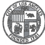
ERIC GARCETTI MAYOR

EMPOWER LA™ Department of NEIGHBORHOOD EMPOWERMENT